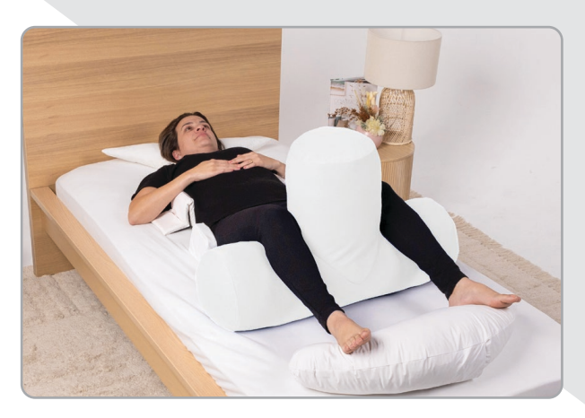
Snoooooze Star (standard), two Tri-fold Positioning Brackets (large), two Curved Wedges (small), T-Roll (large), Banana Cushion