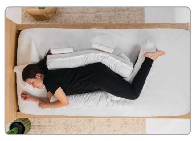
Snoooooze Star (standard), Curved wedges two larges and one small, Twin Roll, Banana Cushion (standard)