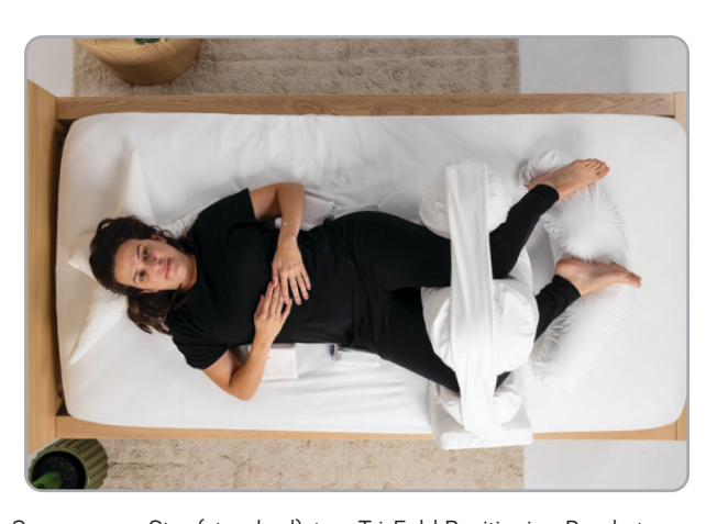
Example of accommodation of windswept hips with Snooooooze range: Snooooooze Star (standard), two Tri-Fold Positioning Brackets (large), two Curved Wedges (small), Curved T-Roll (large), Curved Wedge (large), Banana Cushion (standard)