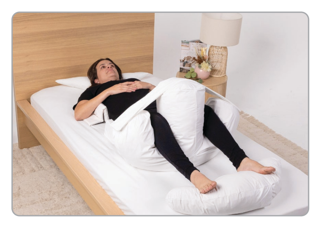
Snooooooze Star (standard), two Tri-Fold Positioning Brackets (large), two Curved Wedges (small), Curved T-Roll (large), Banana Cushion (standard)