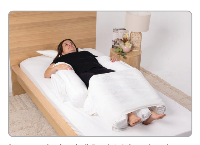
Snoooooze Star (standard), Twin Side Roll, two Curved Wedges (large), W Leg Trough (medium) and a Banana Cushion (standard)