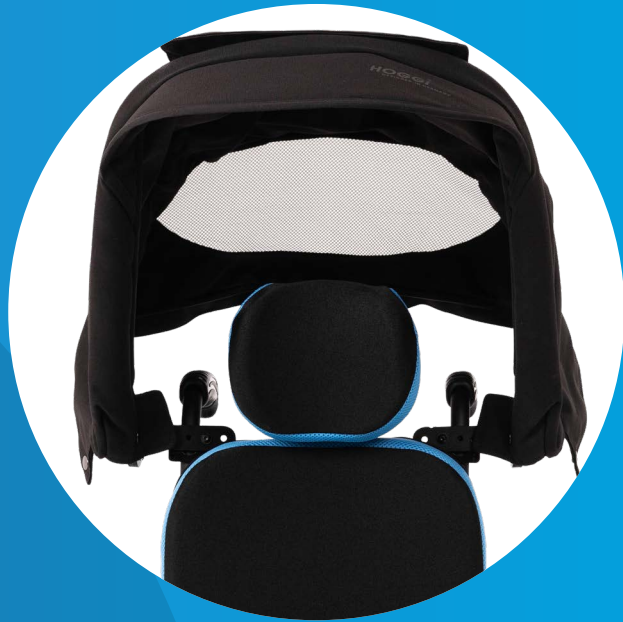
Canopy options for rain or sun