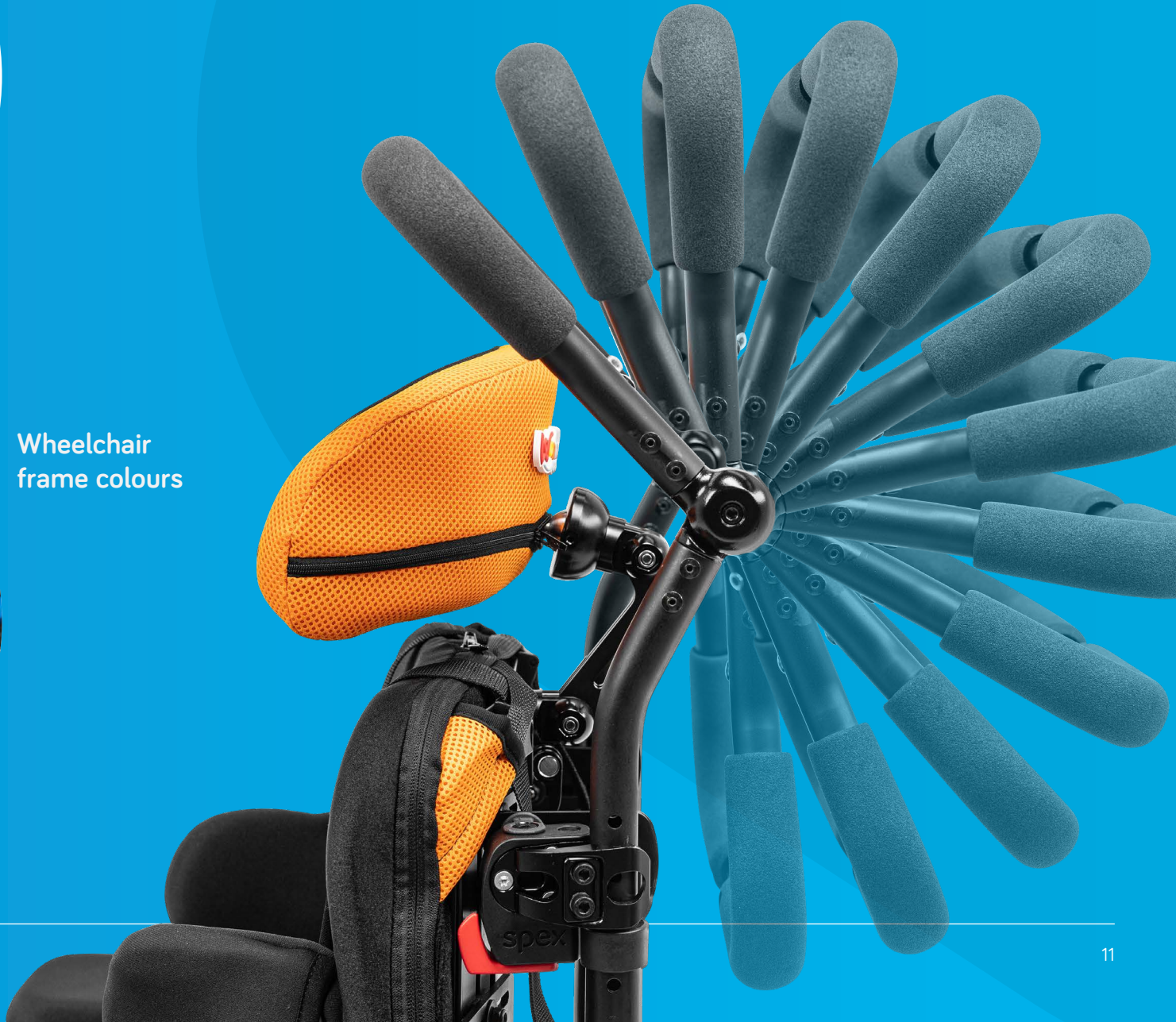
260° adjustable stroller handle