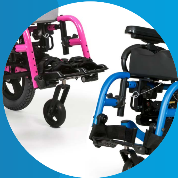
Wheelchair frame colours