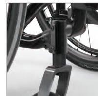
7 INTEGRATED CASTER HOUSING Offers simple and infinite angle adjustments