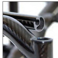
1 CARBON SEAT RAIL Fully molded with integrated seat slider for better seat sling support