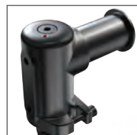
6 ANTI-FLUTTER SYSTEM Provides a smooth, more efficient ride