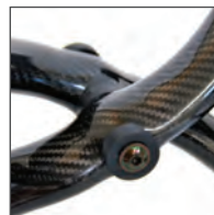
5 ULTRARIGID FOLDING SYSTEM Offers best-in-class propulsion efficiency