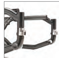
3 HYBRID FRAME DESIGN Eliminates the need for both hemi and standard frame, while providing a complete range of seat-to-floor heights