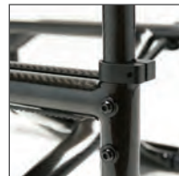
2 REINFORCED BACK CANE SUPPORT For added stability and comfort