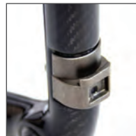
4 FOOTREST ANCHOR Bracket is inset with an integrated friction plate to protect the carbon fiber