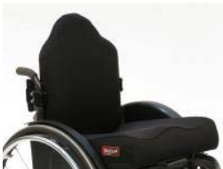
Vigour Mid Back Support

The Spex Vigour back supports offer lighter-weight options for the more active wheelchair users. They are easily removed for wheelchair transportation.