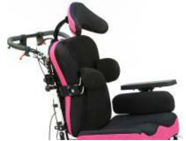
Spex Contoured Head Support