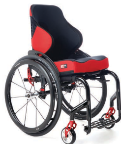
Mantaray Back Support

Shaping within these back supports is possible with the Spex tessellated positioning kit and this kit can also potentially be used under other flat foam cushions to provide increased contouring.