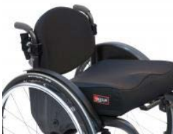
Vigour Lo Back support

The height-adjustable shell option incorporates inbuilt growth adjustment in the back support due to the upper sliding interface.