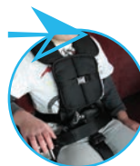
Houdini 27: Good for single seats