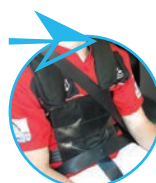
Houdini 13: Buckles behind seat