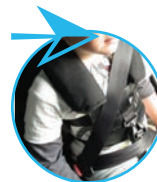
Houdini 22: Easy for taxi/multiple vehicles