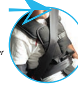
Houdini 28: Versatile all-rounder