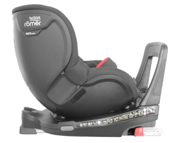
In rearward position