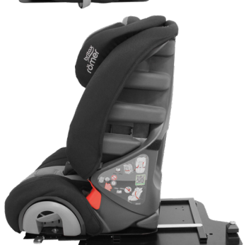
SLIM SWIVEL BASE Allows more space and headroom inside the car when turning out.