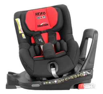
Rotatable by 90°, 180° or 360° for ease of transfers