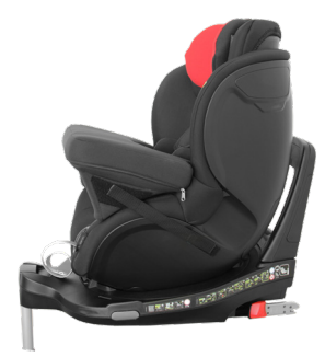
In direction of travel; adjustable back height