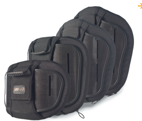
→ Different support levels Always the right support (four heights from 17 to 38 cm)