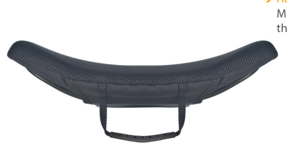
→ Active contour Mild lateral trunk support through 5 cm contour depth

Different needs demand adequate solutions. The four back heights (from 17 to 38 cm) focus on the active user with a need for low to moderate posterior trunk support. Mild lateral trunk support is also given by the 5 cm contour depth.