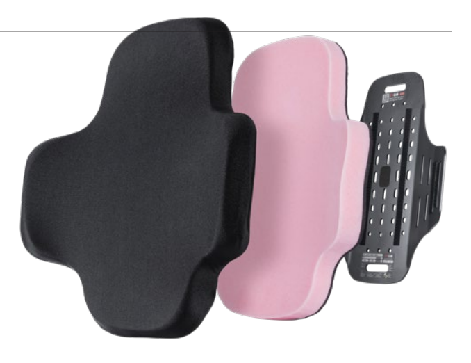
Standard Hardware: Drop Mount Max User Weight: 136kg