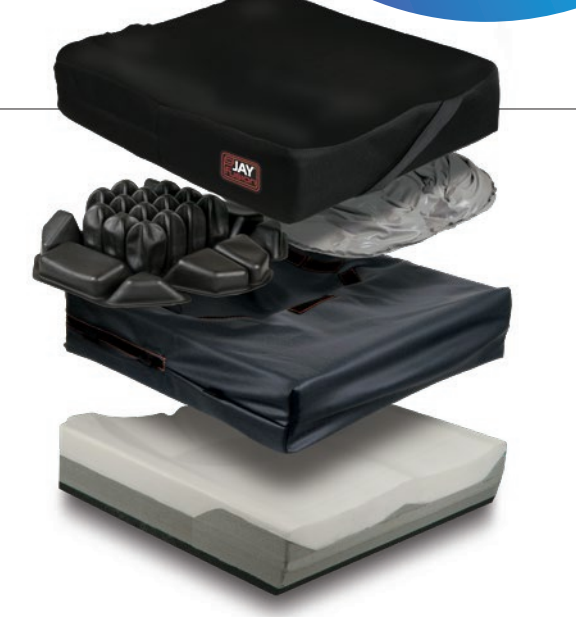
Assessor Accreditation: WMPML1, WMPML1P, WMPML2, WMPML2P

Moisture-resistant inner cover assists with incontinence and moisture management. The anti-microbial outer cover provides good air flow whilst the X-static silver threads help to minimise bacteria build-up. This cover also helps to reduce shear.