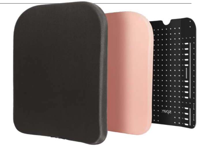
Standard Hardware: Quad Mount Max User Weight: Up to 15" wide: 90kg; 16"+ wide: 160kg