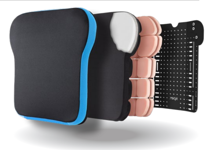
Standard Hardware: Quad Mount Max User Weight: Up to 15" wide: 90kg; 16-20" wide: 136kg

The T-Shape provides superior upper back and shoulder support, and is especially useful in situations where the user requires tilt-in-space, as their upper body and shoulders will have more contact with the contact surface of the back support.