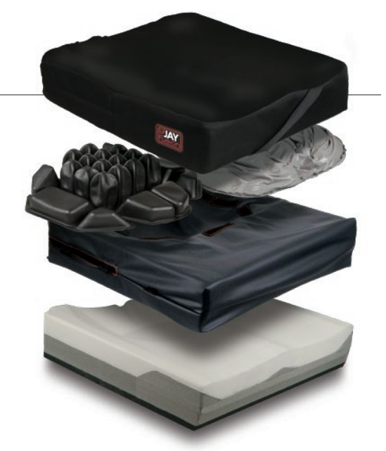
Assessor Accreditation: WMPML1, WMPML1P, WMPML2, WMPML2P

Moisture-resistant inner cover assists with incontinence and moisture management. The anti-microbial outer cover provides good air flow whilst the X-static silver threads help to minimise bacteria build-up. This cover also helps to reduce shear.