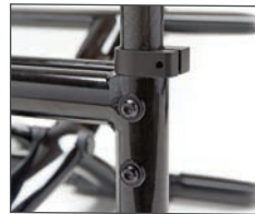
1 REINFORCED BACK CANE SUPPORT For added stability and comfort