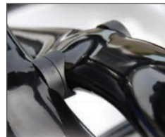
4 ULTRARIGID FOLDING SYSTEM Offers best-in-class propulsion efficiency