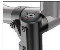
5 ANTI-FLUTTER SYSTEM Provides a smooth, more efficient ride