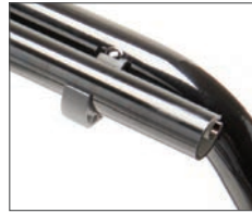
3 ALUMINUM SEAT RAIL With integrated seat slider for better seat sling support