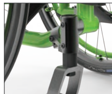
6 INTEGRATED CASTER HOUSING Offers simple and infinite angle adjustments