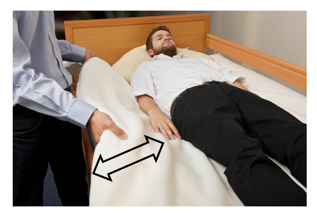
Ensure that there is no danger of sliding too far - use cot sides or a helper at the other side of the bed.

Make sure there are no positioning brackets in place. Working with the bed flat and the user lying on top of the overmantle, you can now slide the user as required. Simply grip hold of the Overmantle and pull towards you.