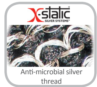
Anti-microbial silver thread