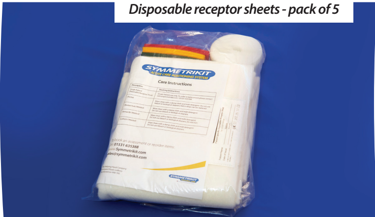
Disposable receptor sheets - pack of 5