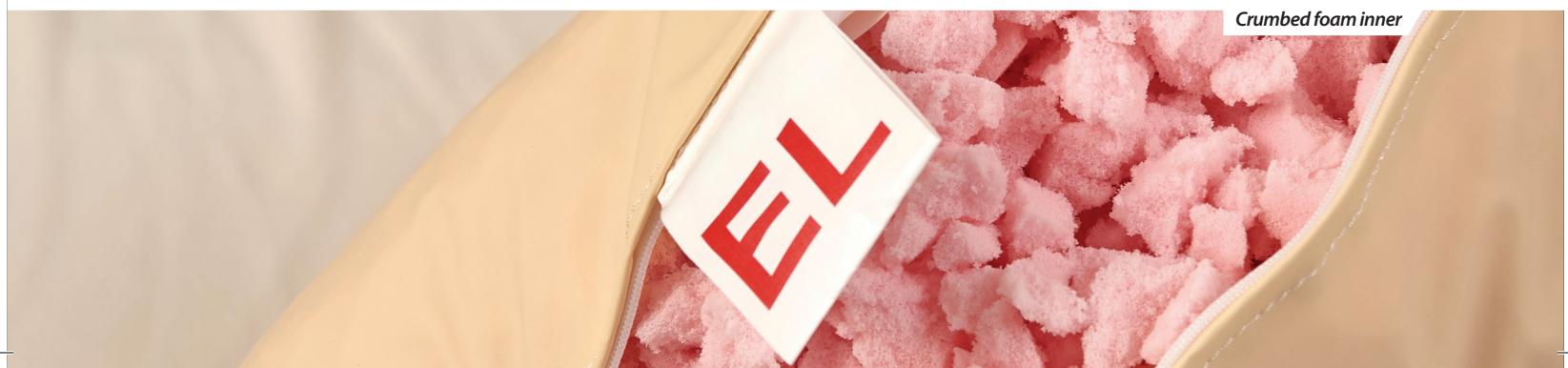
Crumbed foam inner

With support. Heel pressure partially offloaded from = >150 to 132mmHg. Bony prominence area reduced from >150 to 63mmHg. Average reduced from 46.6 to 15.6mmHg.