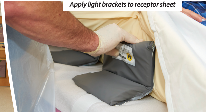
Apply light brackets to receptor sheet