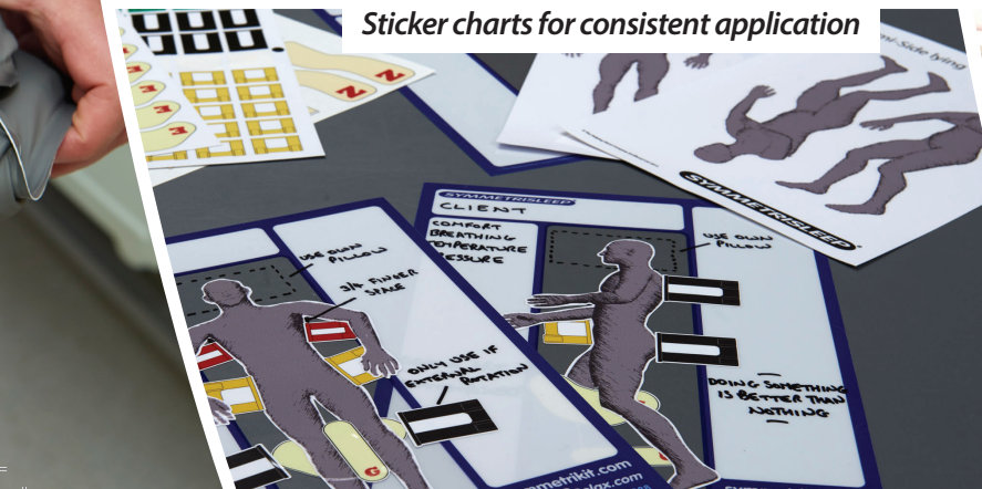
Sticker charts for consistent application