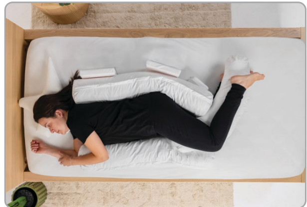
Snooooooze Star (standard), Curved wedges two larges and one small, Twin Roll, Banana Cushion (standard)