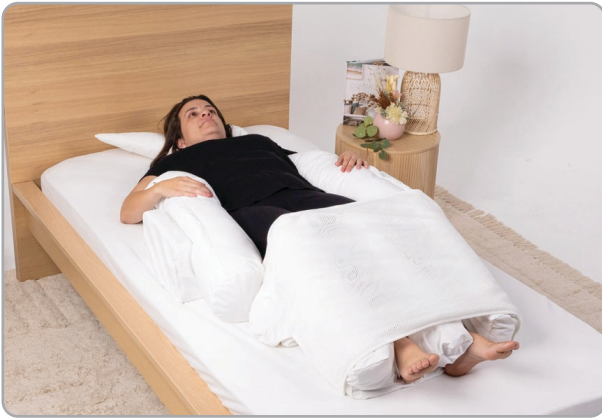
Snooooooze Star (standard), Twin Side Roll, two Curved Wedges (large), W Leg Trough (medium) and a Banana Cushion (standard)