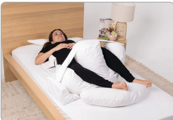
Example of accommodation of windswept hips with Snooooooze range: Snooooooze Star (standard), two Tri-Fold Positioning Brackets (large), two Curved Wedges (small), Curved T-Roll (large), Curved Wedge (large), Banana Cushion (standard)