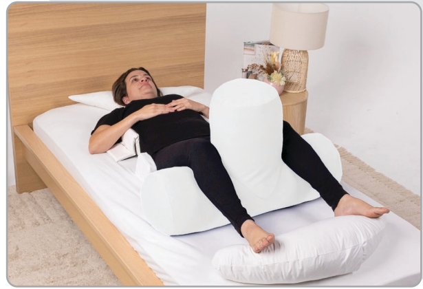
Snooooooze Star (standard), two Tri-fold Positioning Brackets (large), two Curved Wedges (small), T-Roll (large), Banana Cushion