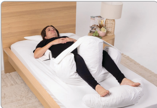
Snooooooze Star (standard), two Tri-Fold Positioning Brackets (large), two Curved Wedges (small), Curved T-Roll (large), Banana Cushion (standard)