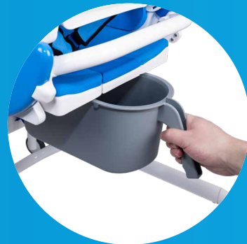
Commode Pan with Retainer