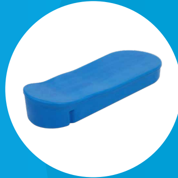
Seat Infill Pad