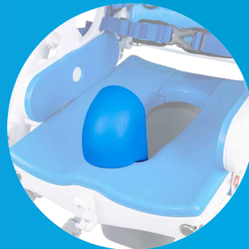
Removable Splash Guard