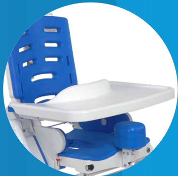
Depth Adjustable Tray Table