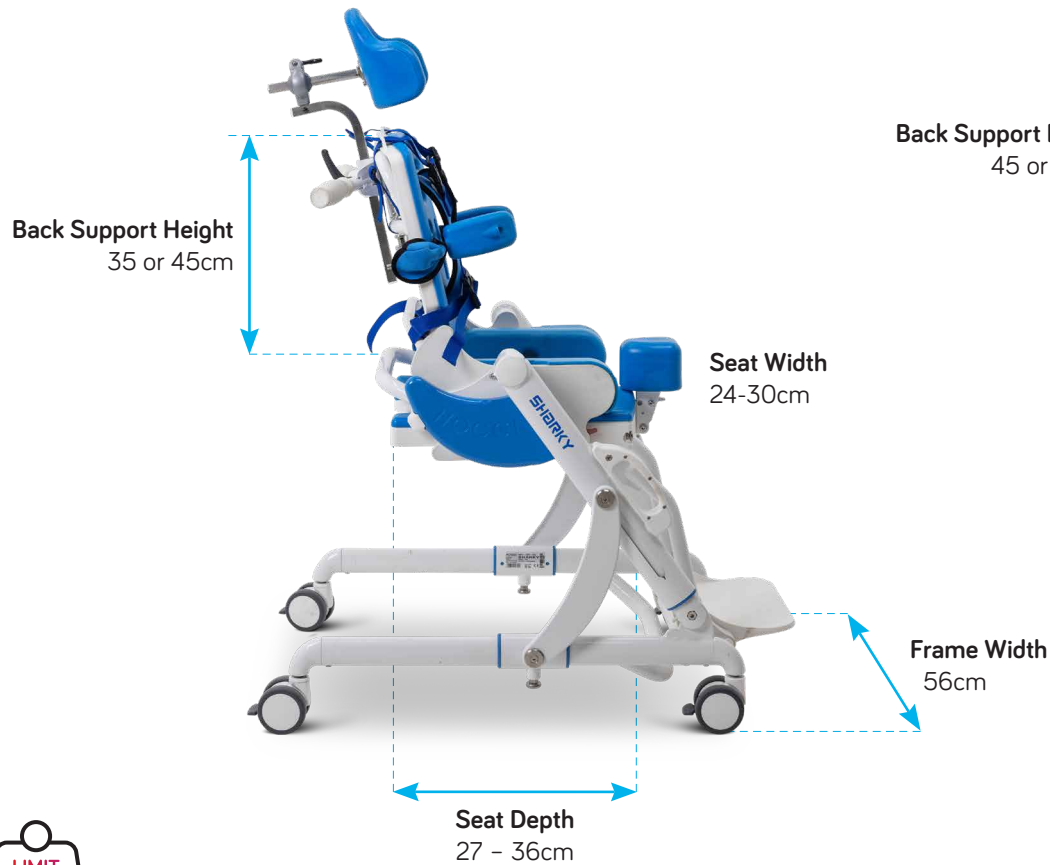
Sharky Size 1