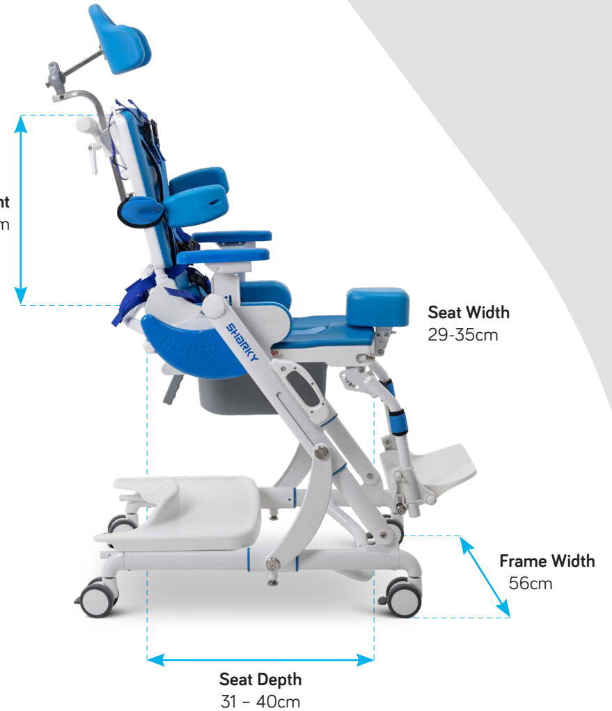
Sharky Size 2