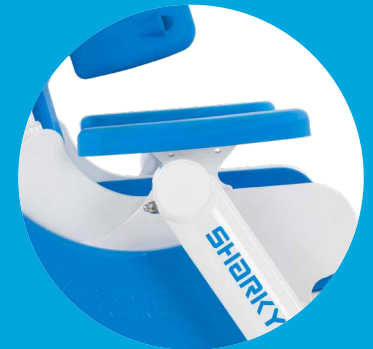
Height-Adjustable Arm Support