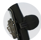
Lateral Trunk Supports