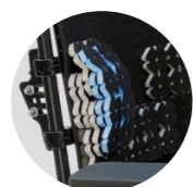
Tessellated Positioning Kit