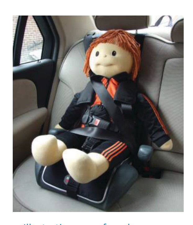
Illustrating one of our harnesses fitted in conjunction with the existing vehicle safety belt.

Booster cushions can be used in conjunction with all our range of vehicle harnesses.