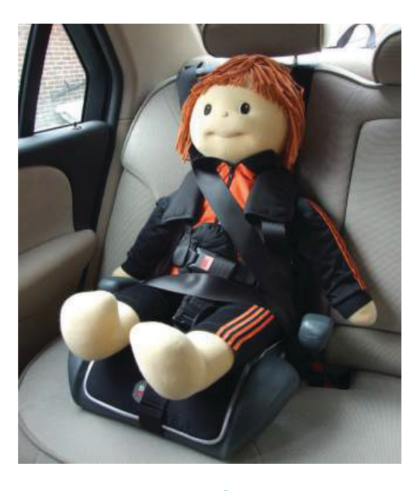
Illustrating one of our harnesses fitted in conjunction with the existing vehicle safety belt.

Booster cushions can be used in conjunction with all our range of vehicle harnesses.